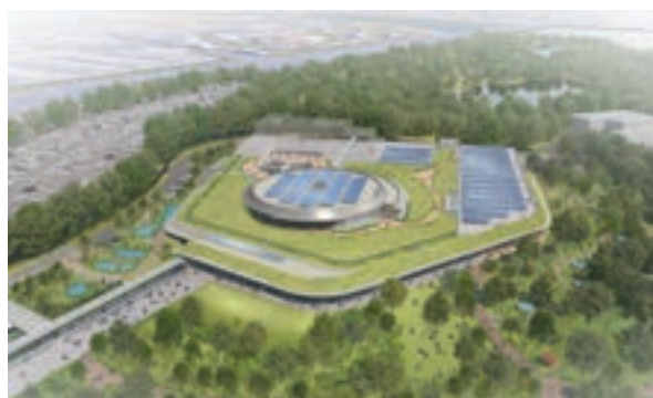
Architectural rendering of the Kasai Rinkai Aquarium (tentative name)

management of the facility. In addition to serving as the representative company of this project, we will also invest in and manage the SPC, among others. The aquarium is scheduled to open in 2028.